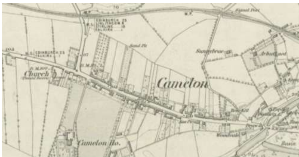
Illus 1: 1864 Ordnance Survey Map showing the Church at the west end of the Village.

Agricultural reform and industrialisation at the end of the 18 th century radically changed the pattern of settlement throughout Scotland, and in the Central Belt in particular. The existing churches served the earlier parishes and were often inconveniently located to cater for the new communities. So, in the 1820s, Dr Chalmers, convenor of the Church Extension Committee, raised large sums of money to create chapels of ease to fill these gaps. In 1838 work began on one such site in Camelon. The village had been created in the 1760s and the new church building lay amongst the fields at the extreme western end of its principal street. The land was given by William Forbes of Callendar .