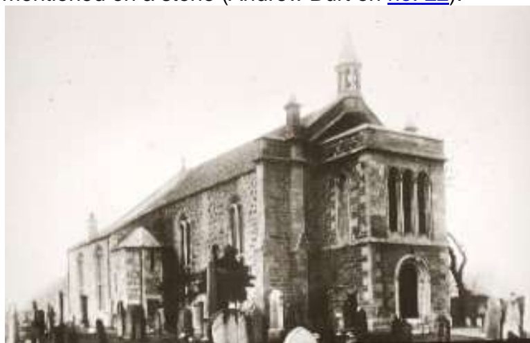
Illus 4: View of the church before the gravestone clearance.

In 1924 an eastern and southern extension to the church building was completed, requiring some re-arrangement of the graveyard. Far greater was the havoc wrought in the 1960s when Falkirk Council “tidied up” the churchyard, leaving only the more substantial monuments and those against the boundary walls. This means that today we are left with a very unrepresentative sample – there is, for example, only a solitary nailer mentioned on a stone (Andrew Burt on no. 22 ).