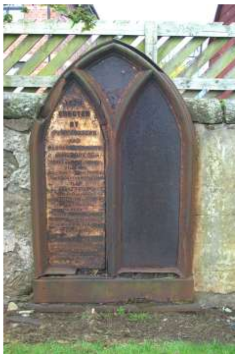
Illus 3: Some of the Cast Iron Grave Markers (left – No. 57 ; right – No. 49 ).

In 1924 an eastern and southern extension to the church building was completed, requiring some re-arrangement of the graveyard. Far greater was the havoc wrought in the 1960s when Falkirk Council “tidied up” the churchyard, leaving only the more substantial monuments and those against the boundary walls. This means that today we are left with a very unrepresentative sample – there is, for example, only a solitary nailer mentioned on a stone (Andrew Burt on no. 22 ).