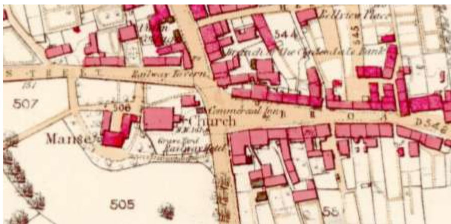
Illus 1: Extract from the 1862 Ordnance Survey Map (National Library of Scotland).

The hillock dominates the locality and it would have been occupied from an early date. However, the present church building dates only to 1813 when the rectangular hall-type structure was erected, followed six years later by the tower at the east gable. The original church at Denny is much older and it was disjoined from Falkirk in 1601. The only remnant of that early church is a sundial at Hallhouse . It would have been smaller than its successor, occupying the site of the chancel and the east end of the nave.