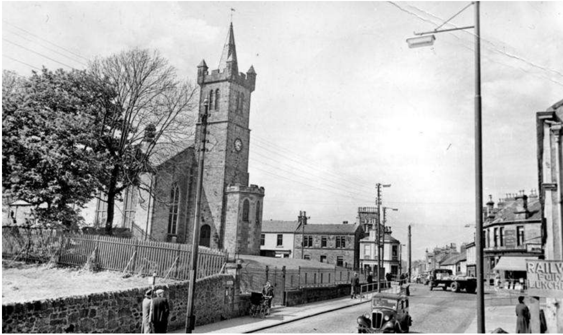
Illus 3: Denny Cross, c1950. The churchyard now has a low wall with railings and the ground inside has been scarped.