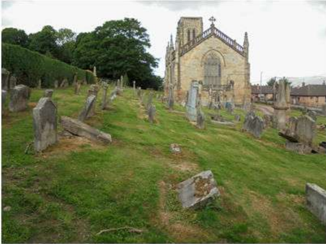
Illus 1: Airth North Churchyard looking north.