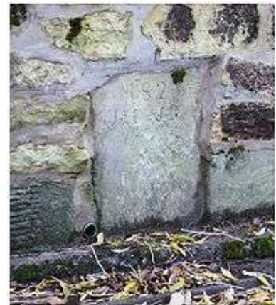
Illus 5: Gravestone in the Retaining Wall beside the road leading to the Cemetery.

At some point, presumably when the graveyard was extended, some of the gravestones from the churchyard were used in the retaining wall on the south side of the road leading up the hill from the mercat cross to the main entrance to the cemetery. Most are fragmentary, but one is complete and reads: "1823/ JH JR."