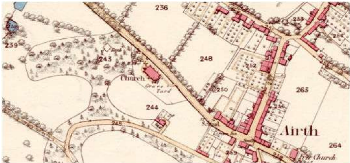
Illus 3: Extract from the 1862 Ordnance Survey Map.