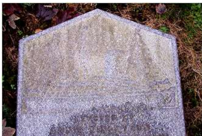
Illus 8: Stone 65 with an accurate and detailed depiction of SS Carron. The stone has fallen and so the contrast between the polished surface and the lighter grey background is no longer sufficient to show the image in a clear light.