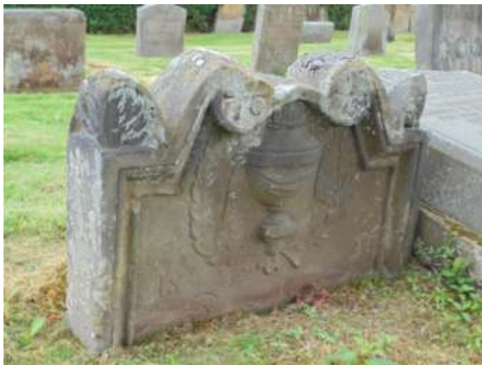
Illus 10: Stone 133