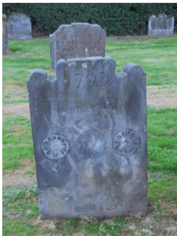
Figure 1 illus 11: Stone 149