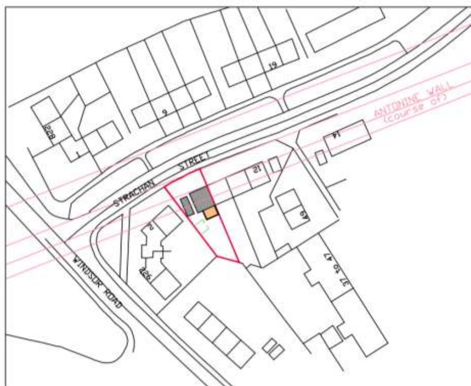
Illus: Location plan (Barry Sturrock).

the stratigraphy in this area in compliance with the Special Panning Guidance for the WHS. The proposed extension is located just to the south of the linear barrier, in an area often occupied by ancillary structures such as enclosures and expansions. The excavation was undertaken on 23 April 2022.